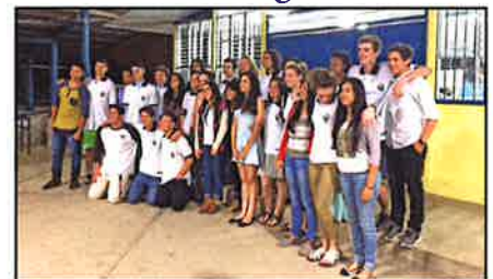
After BUHS Costa Rica Exchange members prepared a potluck dinner for their host families, Costa Rican participants gave their BUHS partners a Colegio Tecnico Dulce Numbre shirt.