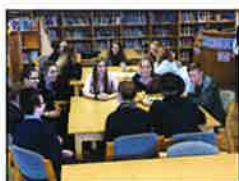
Students interacted with Catholic school students in Belfast